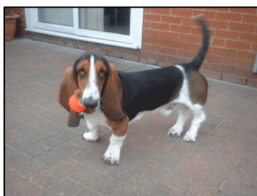
Bertie 'Playing Ball'