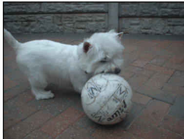
Monty 'Playing Ball'