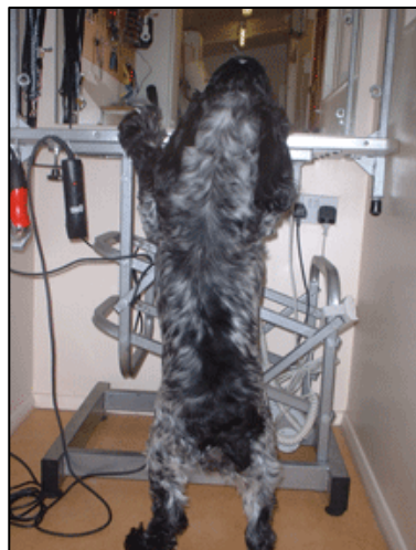
Millie 'Trying to get onto the table'